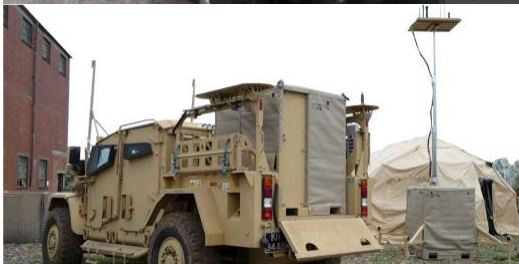
Rapid Deployment & Expeditionary Solutions