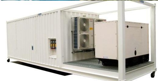
Specialist Containers & Shelters