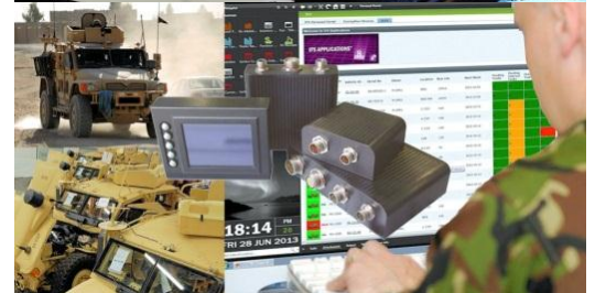
System Monitoring Solutions